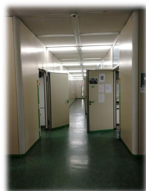
Labs in KIT