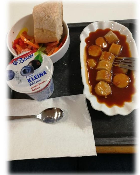
Regular lunch (curry wurst)