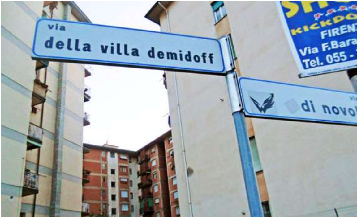
The direction indicator to the street of Demidoff.

Then we have had a mini dinner in McDonalds and to 9 pm we have come to the hotel and gathered in the meeting room to share our information and make a final presentation.