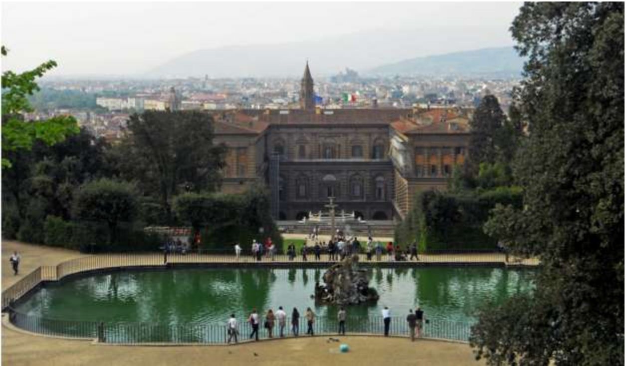
Grand view to the Palazzo Pitti from Boboli Garden