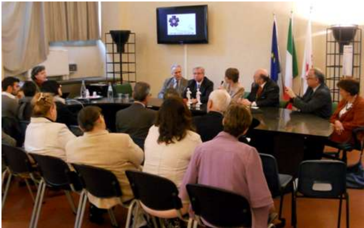
The memorandum is going