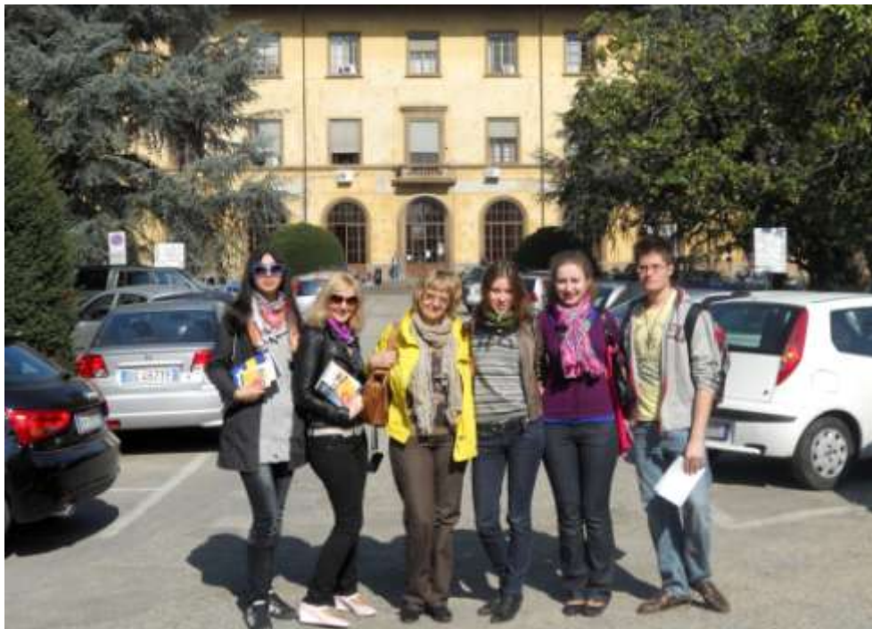
Our group is in front of main building of Engineering Faculty of University of Florence