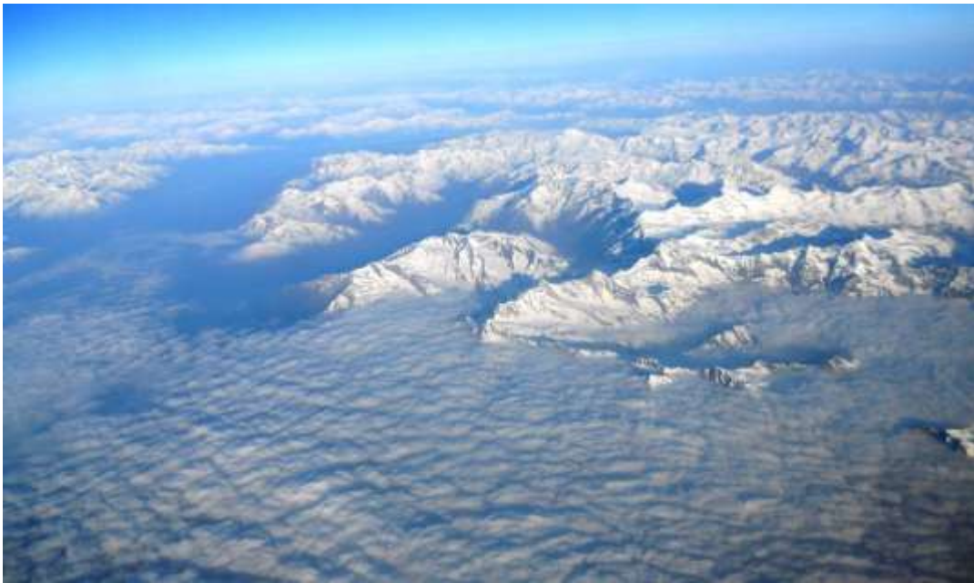
Alps through the window of the plane

What was the most attractive thing of this day is the flight Florence-Munich-Moscow. We have been flying through the Alps