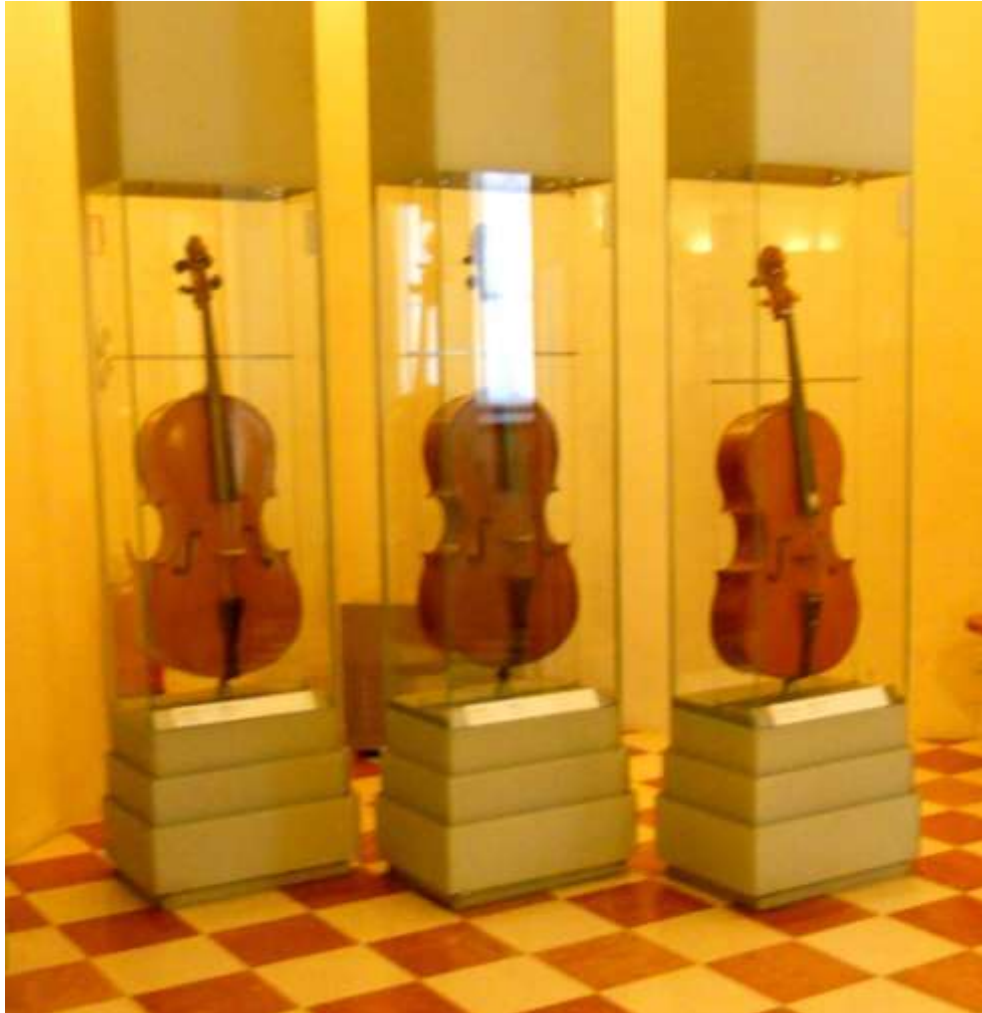
Violas in the Museum of Instruments at Academia Gallery, Florence.

At 2 pm we were at Academia Gallery – a museum, where every exhibit is natural as it was created by the origin author and never was changed (besides restoration). This museum is the museum of a peculiar meaning, because it contains 3 independent museums: museum of instrument, museum of sculpture and general hall and each of the parts has an exhibit of an extra importance for the history. For example, in the museum of instrument there are a number of violins and violas of Antonio Stradivari made of spruce and marble wood.