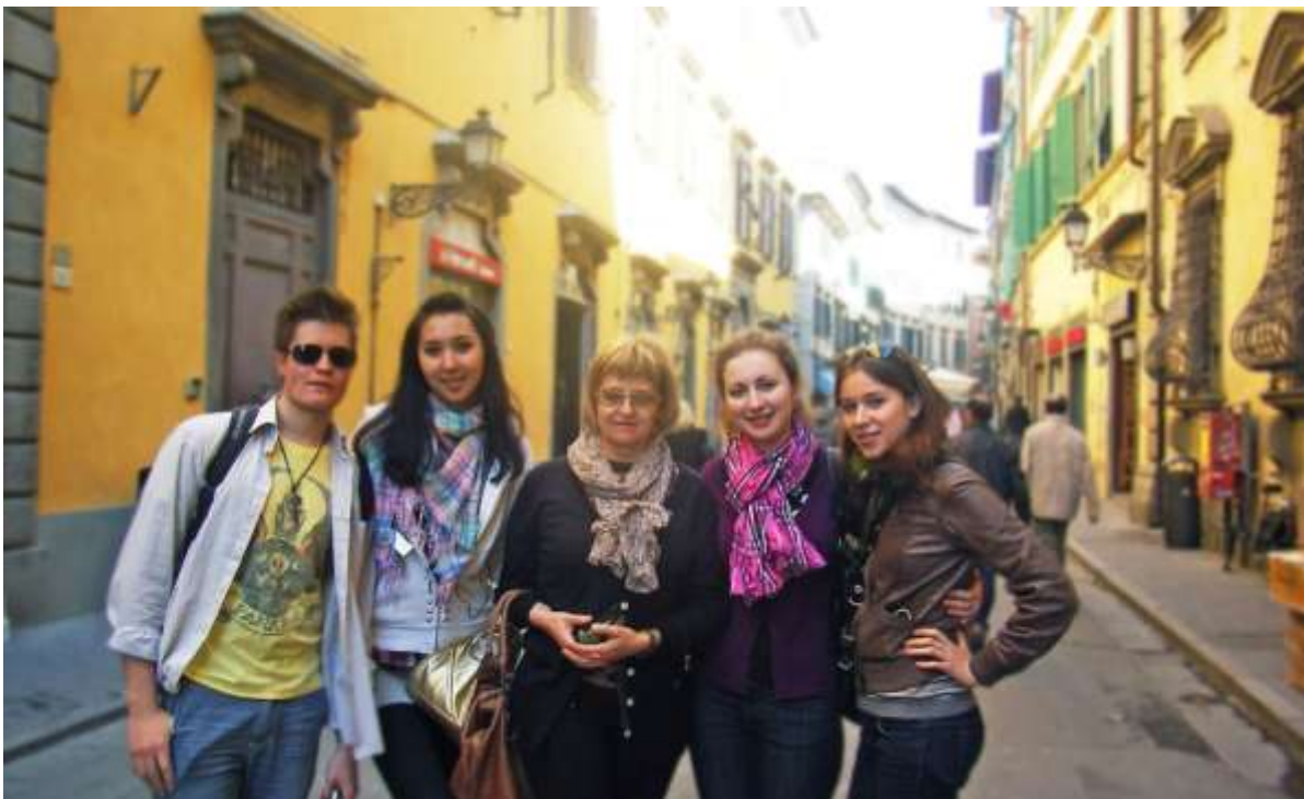
Our cool team!

We have walked up its stairs and then observed Pisa from the Tower.