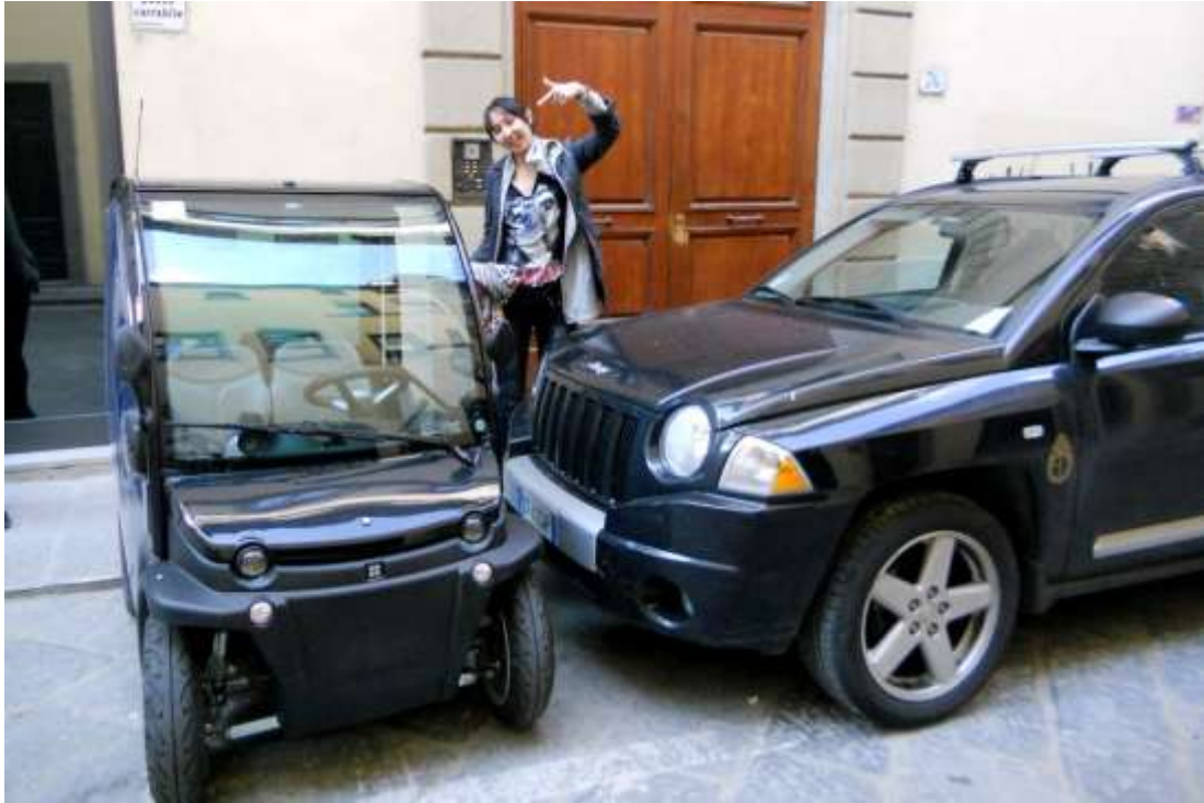
Electromobile vs Automobile

After the lunch we have decided to go to observing square Piazza Michelangelo. Today is a Palm Sunday and there are branches of the oil tree near the church on the piazza Michelangelo. While we have been walking to the square we have meet some interesting things! OMG, what is it? This is electro-car! It looks like a parody of a car. So funny!