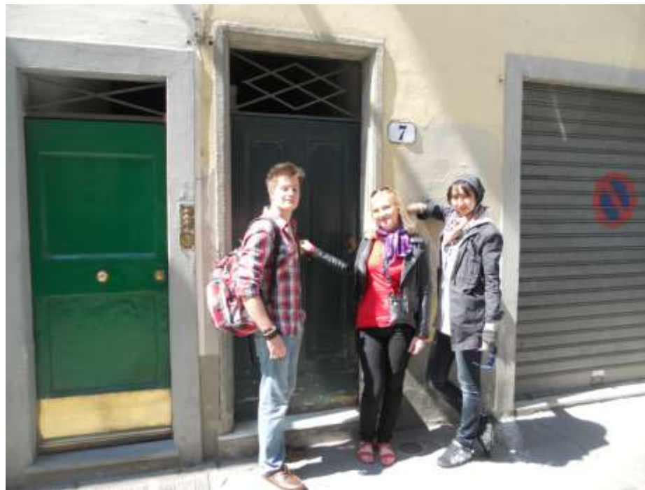
The outside view. Entrance door to the house.

This is our last day staying at Quadra Key Hotel and we have moved to another place, this is a small apartment in the heart of Florence, close to train station.