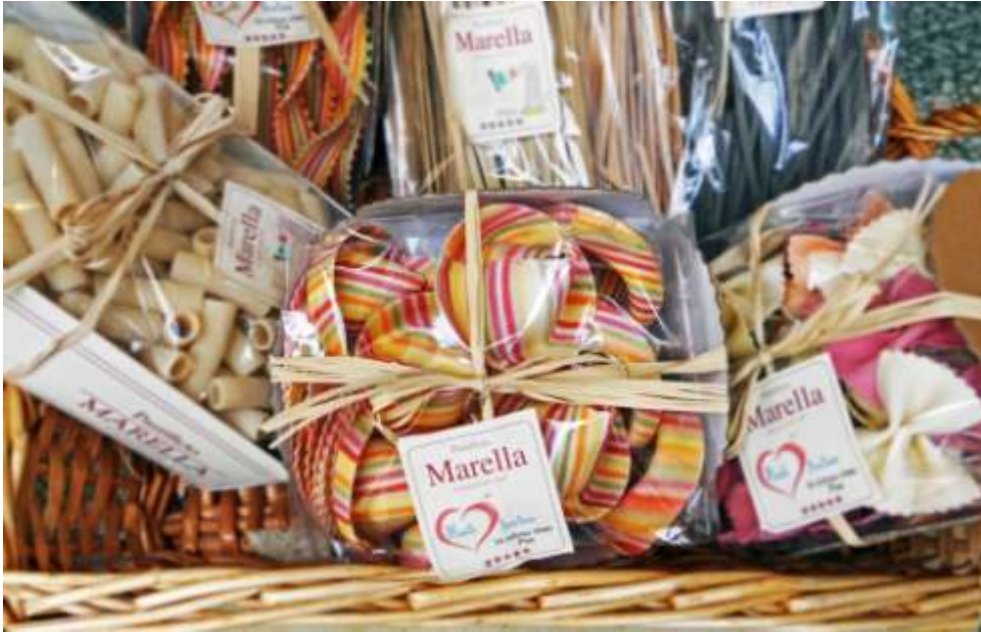
The variety of pasta