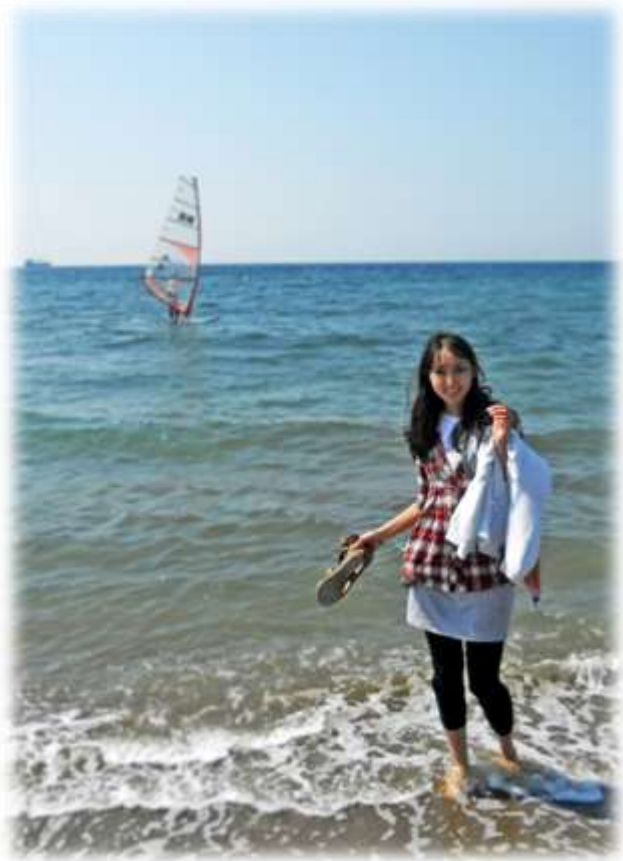
Walking to the shore and looking like a mermaid of the deep-water Ligurian see