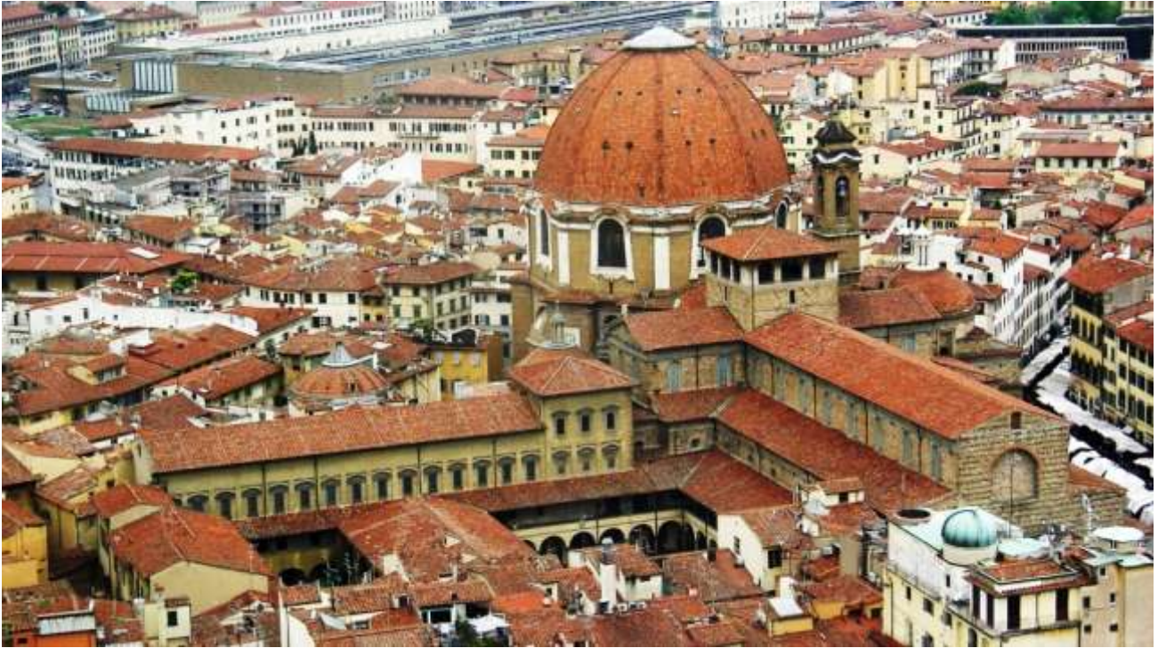
Panorama of the San Marco Museum from the Dome of Santa Maria del Fiore Cathedral