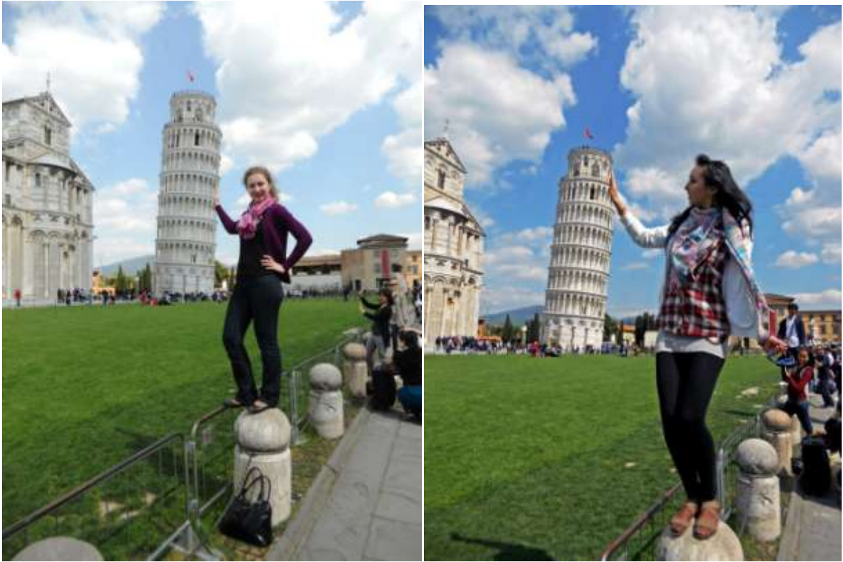
The most well-known photo with Leaning Tower of Pisa that tourist love to make