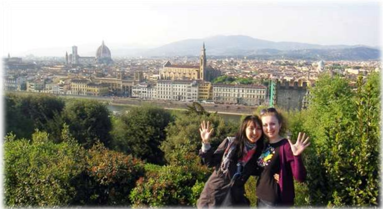
And this is our photo on the top of the world!