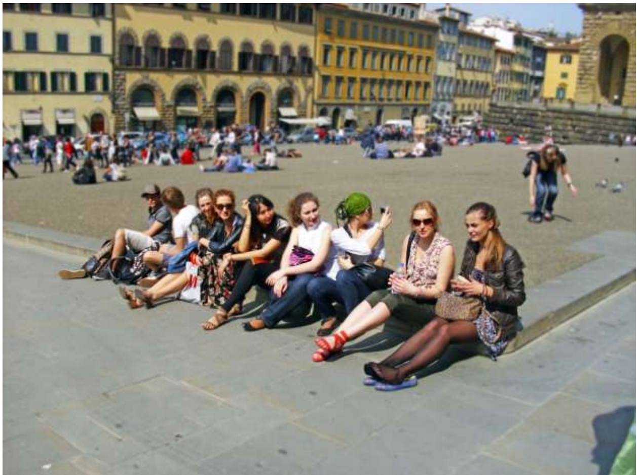
Group of students from all the universities participating in the workshop sitting at the square close to Palazzo Pitti

We have seen the garden of the academy, it was quite nice to have a walk there, because the air there is so clean and fresh, and it seems that Florence is some kind of stone jungles. So the walking in the garden was great, but... the best garden in Florence is the Boboli Garden beyond the Palazzo Pitti, where we have come after a short walking after visiting Accademia della Crusca.