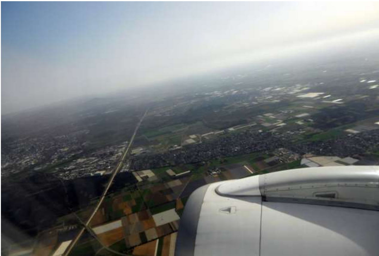
Lovely view of surroundings of Florence from the illuminator of the plane.

Daily report/ Florence, April 2011 2011.04.10. First day