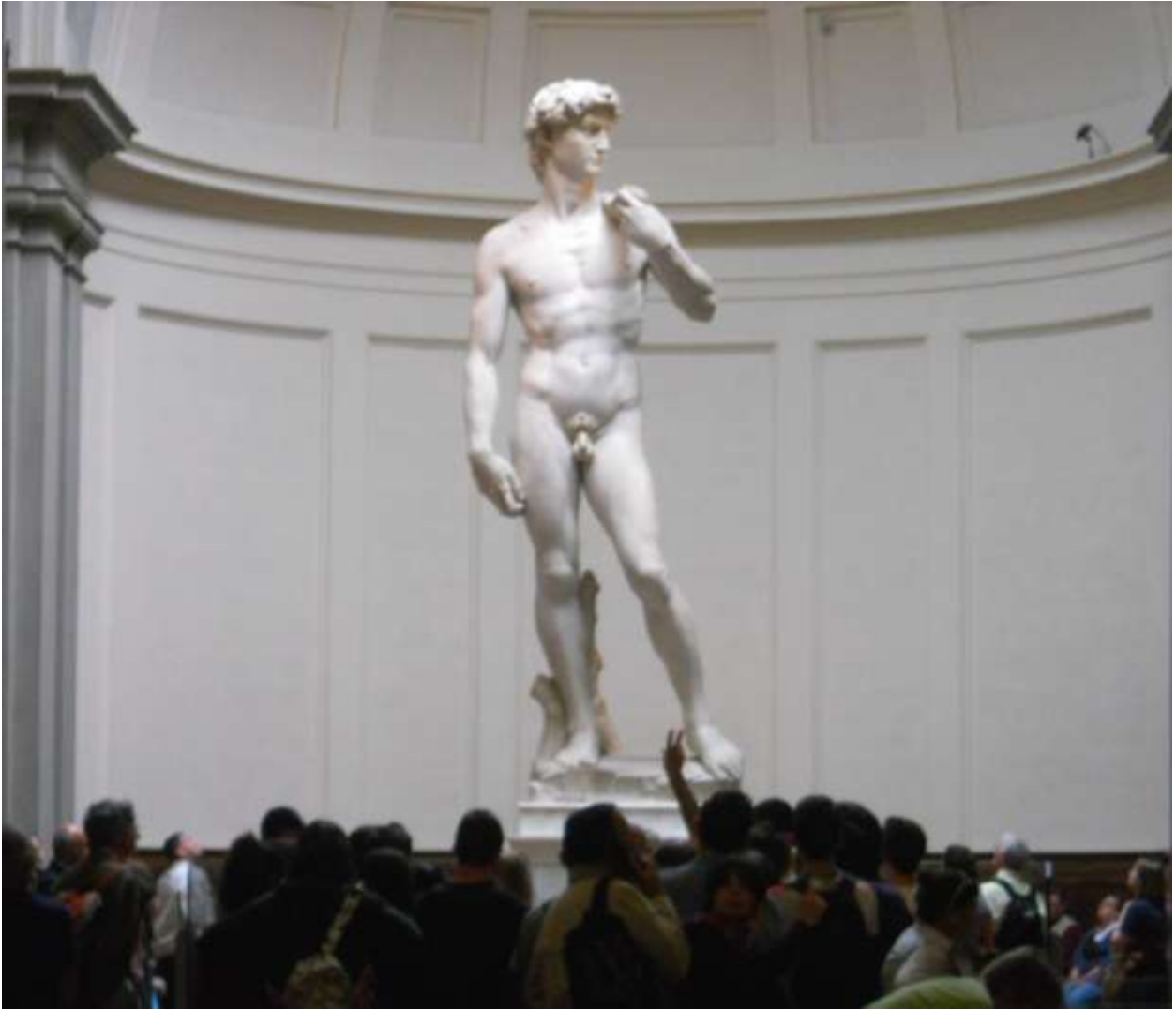
Michelangelo. David, 1501-1504, Academia Gallery, Florence

There were also a lot of other works of Michelangelo, but this is the most popular. As a matter of fact, and I still cannot understand it, the most attractive part of David's sculpture is its reproductive organs. They decorate many souvenirs and even shorts and aprons which must be dressed directly on body, and look very horrible and disgusting.