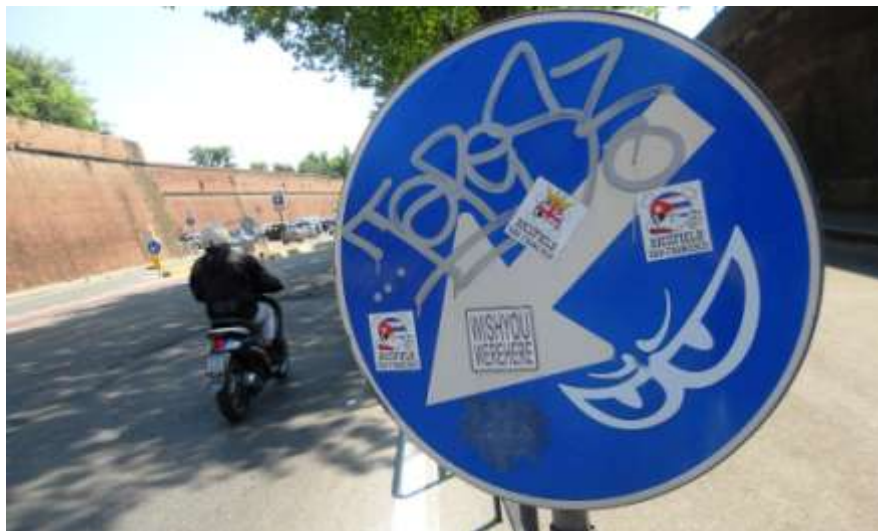
The sign "around obstacles on the left" has got traces of creativity of Florentine residents