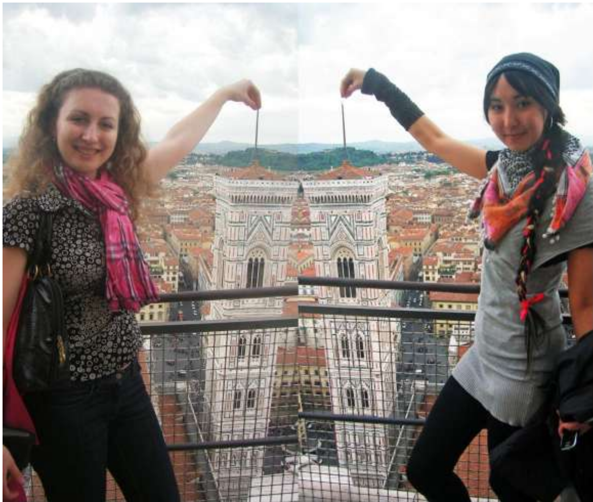
How to feel yourself giant...