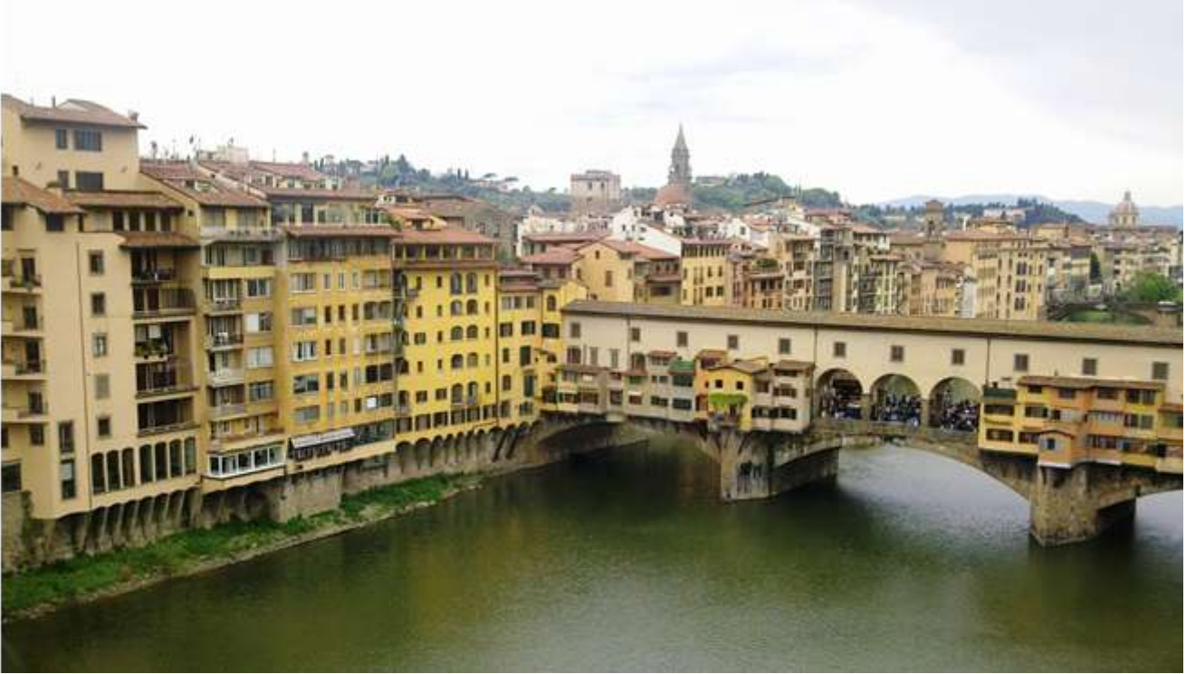
Magnificent view to the gold bridge Ponte Vecchio from Uffizi Gallery.

At 4 pm we have met near the entrance to Uffizi Gallery. This is the main gallery in Italy, the most attractive place for tourist in Florence and is highly important to the European history of culture and art. Uffizi Gallery is a real treasure house of Florentine culture and heritage.