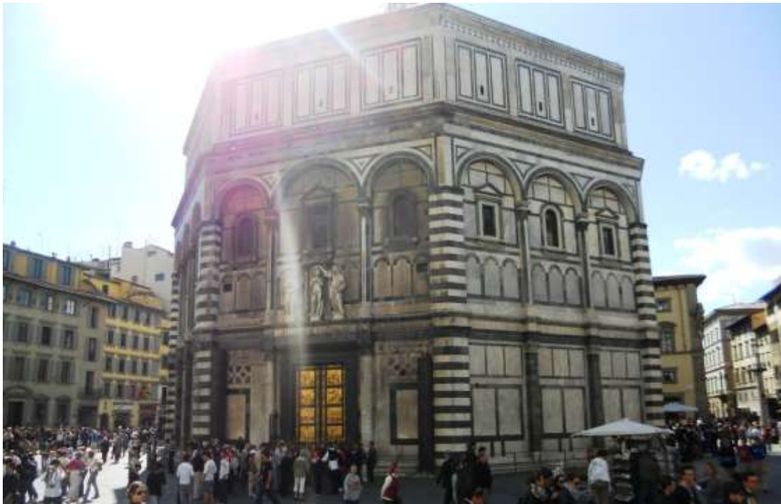
Baptistery of Santa Maria del Fiore with a gold entrance

The Italian poet Dante Alighieri and many other notable Renaissance figures, including members of the Medici family, were baptized in this baptistery. In fact, until the end of the nineteenth century, all Catholic Florentines were baptized here.