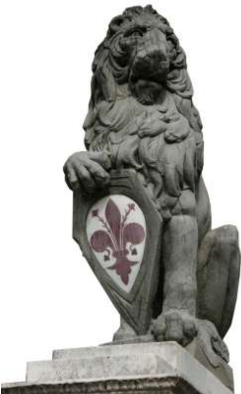
Donatello. Marzocco, 1420. Bargello Museum

Ok, now we have visited museum Bargello where are a lot of works of Italian sculptors such as Giambologna Jacopo Sansovino, Iacopo Tatti etc. of 14-16 century. The first sculpture I have noticed is the bust of Cosimo Medici, the first of Medici family. This bust was made by Benvenuto Cellini in 1545. Another attractive creation is a door of the safe of Cosimo made of bronze with gilding by Vincenzo Danti in 1559. The central scene on the door shows a monarch identified as Numa Pompilius: burning prophetic books and scene is flanked by two allegorical figures while Peace is represented burning weapons in the oval at the bottom. When you go through the rooms of museum you feel so specific atmospheres and you cannot just pass without any stops. Every exhibit is so attractive and magnificent so it can take hours and hours to watch everything there. But we have had limited time to explore everything. Nevertheless the most important and interesting exhibits couldn't avoid our attention. They are the sculpture of Bacchus, the god of winemaking, made by Tatti, various interpretations of paintings and sculptures of Madonna and Child by different authors, dated 15 century, works of Donatello, for example, the outstanding one is marble statue of David (1408), another one that has a very significant meaning is Marzocco.