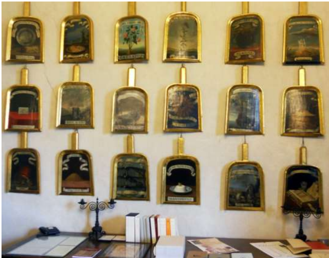
Decorative backer's shovels are main symbols of Academia della Crusca

We've woken up at 7 am and by 7:45 we were at the breakfast. The weather was quite cold and we thought it would be better to have umbrellas with us, but this idea came to us only when we were at the street going to the café. Anyway after the breakfast we returned to take the umbrellas. Our way was directed to Academia della Crusca and it took about 1,5 hours to achieve the destination. There we've had a guide tour during which I got to know a lot of new and interesting information. For example, Academia della Crusca translates to English as the Academy of Bran. This name has a short story: at that time academicians that were involved into the working out of the Italian dictionary and development of the linguistic aspects of Italian language associated their work as grain processing, when during the process the grain was being separated from the bran. That was meant that bad was separated from the good, and in this case, the bran was meant bad lexicon of the language and, in contrary, the grain was the good one. And the union of academicians decided to name this academy as Academy of the Bran instead of Grain, because, as they had guessed, there is no difference for the linguist, because linguist must be interested in all parts of the language.